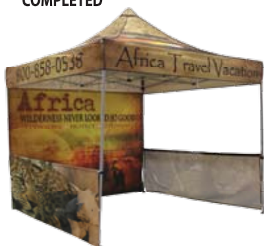
(Shown with optional Backdrop and Rail Skirts)