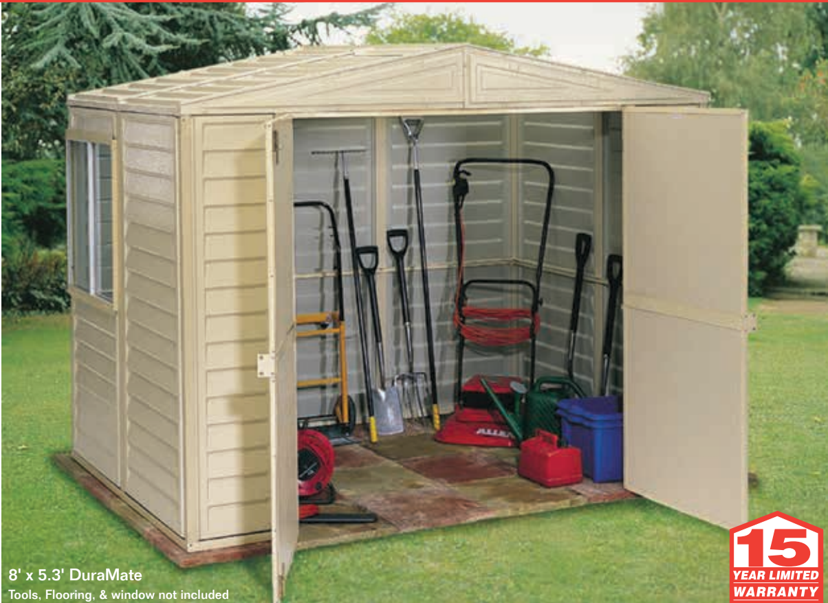
8' x 5.3' DuraMate Tools, Flooring, & window not included