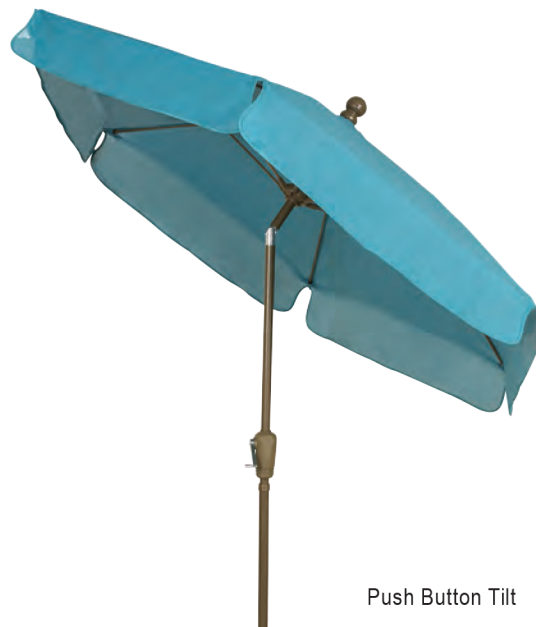
Push Button Tilt