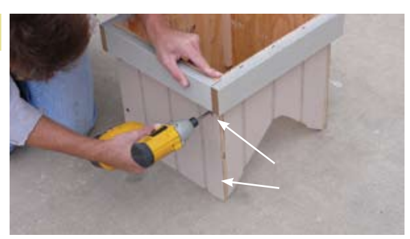
Complete chimney assembly.