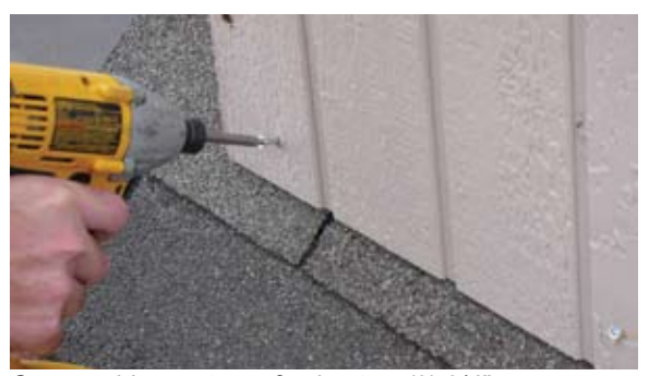
Secure chimney to roof using two (2) 21/2" screws along base of chimney on both sides.