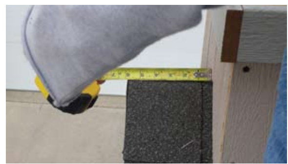
Carefully lift chimney to the roof. Measure inward 6" from end of roof and set chimney in place.