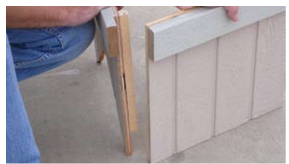
Locate and prepare to assemble chimney sections.